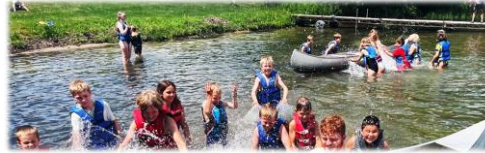
Camp Hiawatha Camp Vermilion